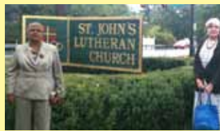
St. John Morrisville September 12, 2010