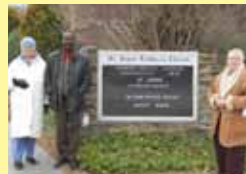
St. John Melrose Park December 19, 2010

Faith, Woodhaven Road June 26, 2011 Wrong worship time posted on web. NO PHOTO