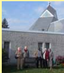
Good Shepherd King of Prussia Reformation Sunday, 2010