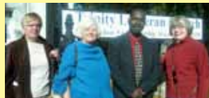
Trinity, Germantown November 14, 2010