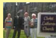
Christ, Upper Darby August 21, 2011 The first church we visited that was like Redeemer in breadth of diversity.

Holy Communion Philadelphia August 14, 2011 NO PHOTO