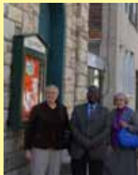
Atonement Fishtown October 17, 2010