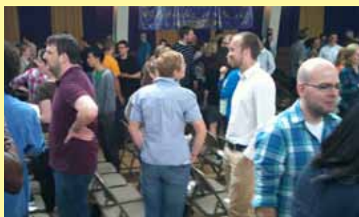
liberti presbyterian, Fairmount May 15, 2011

On invitation, we made our first non-Lutheran Ambassador trip. This new congregation had some 200 young people between the ages of 25 and 35 and a group of children, all under 8. Their ministry plan was very much like the plan Redeemer was following with success. While Lutherans are locking East Falls Christians out of the church, this group is sponsoring two house churches in our backyard.