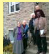
St. Mark Conshohocken November 21, 2010

Zion, Flourtown January 9, 2011 Cold and gusty NO PHOTO