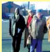
St. Timothy Fox Chase January 16, 2011