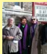
Zion, Olney February 20, 2011