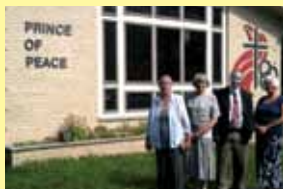
Prince of Peace Plymouth Meeting August 8, 2010