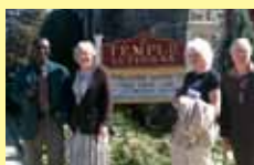
Temple, Havertown Oct 9, 2011

On invitation, we made our first non-Lutheran Ambassador trip. This new congregation had some 200 young people between the ages of 25 and 35 and a group of children, all under 8. Their ministry plan was very much like the plan Redeemer was following with success. While Lutherans are locking East Falls Christians out of the church, this group is sponsoring two house churches in our backyard.