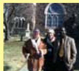
St. Michael's Germantown February 27, 2011