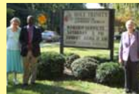
Holy Trinity Abington September 19, 2010