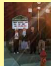
St. Michael's Kensington September 18, 2011