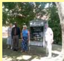
St. John's, Folcroft July 31, 2011