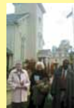
St. Peter's North Wales Nov 13, 2011