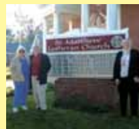
St. Matthew's Springfield Oct 23, 2011