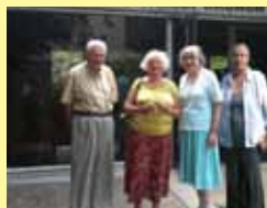
University Lutheran West Philadelphia August 15, 2010