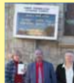
Christ Philadelphia Nov 28, 2010