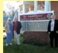
St. Matthew's Springfield Oct 23, 2011