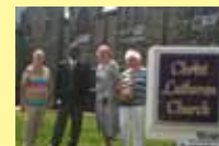
Christ, Upper Darby August 21, 2011

Holy Communion Philadelphia August 14, 2011 NO PHOTO