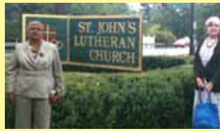
St. John Morrisville September 12, 2010