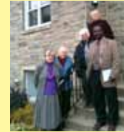
St. Mark Conshohocken November 21, 2010

Zion, Flourtown January 9, 2011 Cold and gusty NO PHOTO