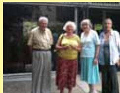
University Lutheran West Philadelphia August 15, 2010