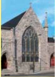
Old Zion Philadelphia October 10, 2010