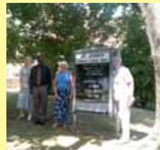
St. John's, Folcroft July 31, 2011