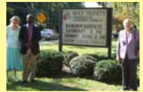
Holy Trinity Abington September 19, 2010