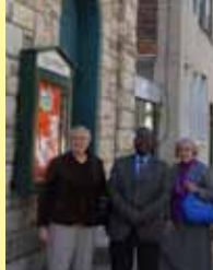
Atonement Fishtown October 17, 2010