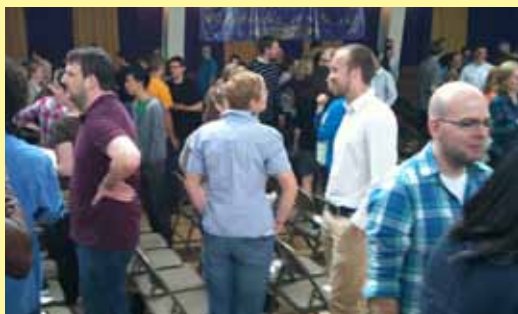
liberti presbyterian, Fairmount May 15, 2011

On invitation, we made our first non-Lutheran Ambassador trip. This new congregation had some 200 young people between the ages of 25 and 35 and a group of children, all under 8. Their ministry plan was very much like the plan Redeemer was following with success. While Lutherans are locking East Falls Christians out of the church, this group is sponsoring two house churches in our backyard.