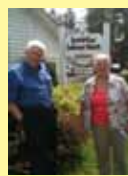
Hartwick New York August 14, 2011

Holy Communion Philadelphia August 14, 2011 NO PHOTO