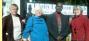
Trinity, Germantown November 14, 2010