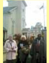
St. Peter's North Wales Nov 13, 2011