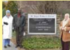
St. John Melrose Park December 19, 2010

Faith, Woodhaven Road June 26, 2011 Wrong worship time posted on web. NO PHOTO