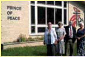
Prince of Peace Plymouth Meeting August 8, 2010