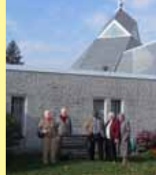
Good Shepherd King of Prussia Reformation Sunday, 2010