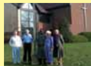
St. Michael Unionville, Nov 27, 2011