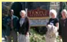
Temple, Havertown Oct 9, 2011

On invitation, we made our first non-Lutheran Ambassador trip. This new congregation had some 200 young people between the ages of 25 and 35 and a group of children, all under 8. Their ministry plan was very much like the plan Redeemer was following with success. While Lutherans are locking East Falls Christians out of the church, this group is sponsoring two house churches in our backyard.