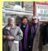
Zion, Olney February 20, 2011