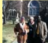
St. Michael's Germantown February 27, 2011