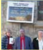
Christ Philadelphia Nov 28, 2010